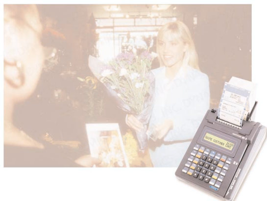
T77-S (with optional sprocket printer) in a retail environment